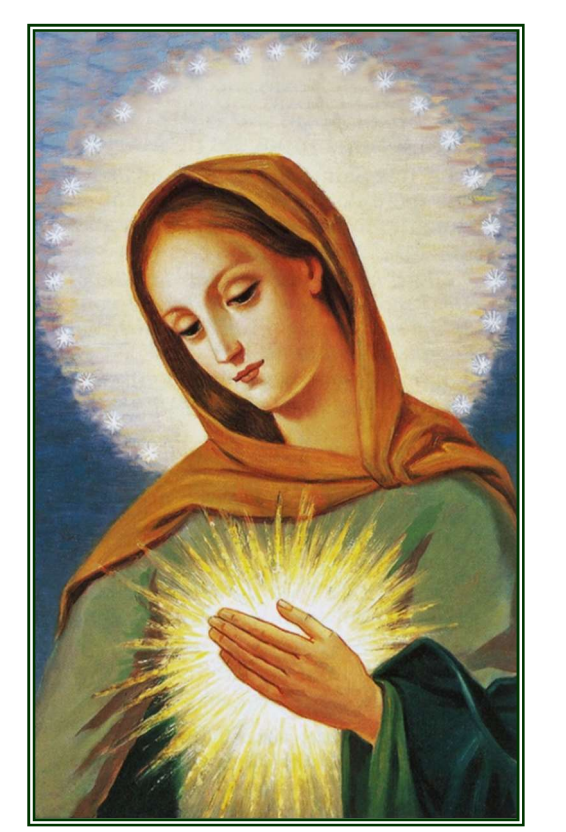
THE FLAME OF LOVE OF THE IMMACULATE HEART OF MARY